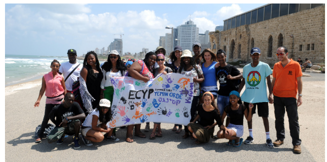
ECYP fellows and Israel teens in Tel Aviv