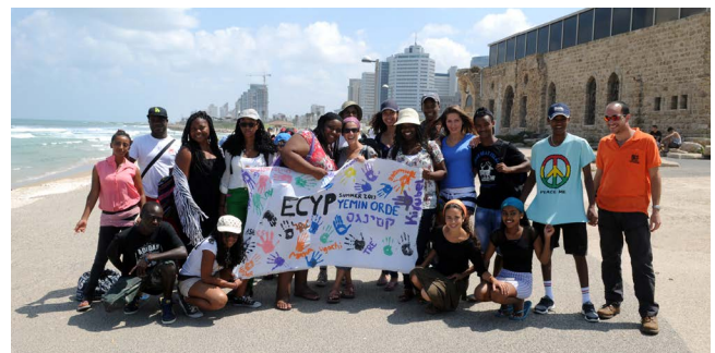
ECYP fellows and Israel teens in Tel Aviv